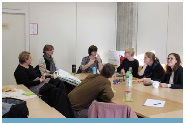
Esslingen students discuss sustainability

Keep checking www.nursus.eu for up and coming events and further project information!